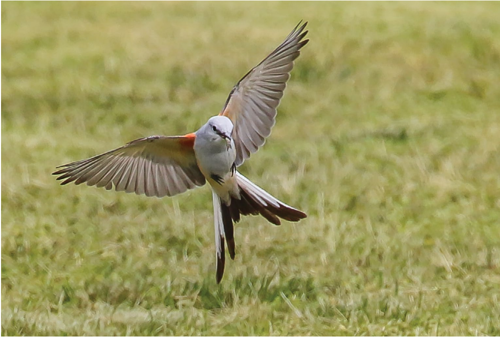
Scissor-tailed Flycatcher

to the nature place in time (I had to be back in Tulsa for some wedding function) - so I sped up a little. Then they sped up a little. Then I did, then they. Was I herding them?