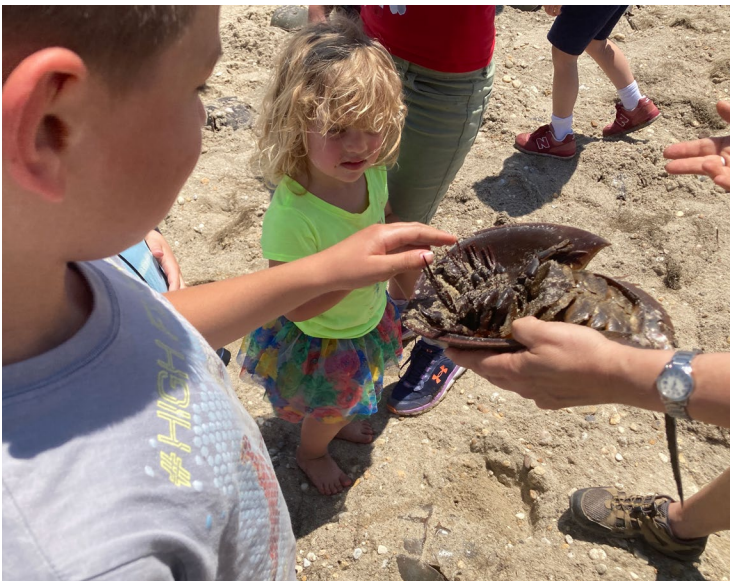
Checking out a Horseshoe Crab underneath

While we missed a few favorites on the crossings like Northern Gannet due to being later in the season, we did see a Glaucous Gull, Brown Pelicans, both types of loons, Common and Red-throated, and many other species.