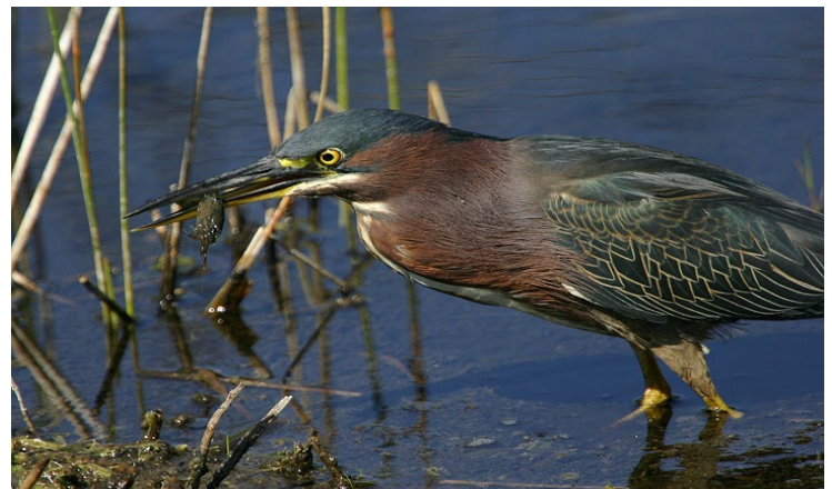
Green Heron

The Lake had so much algae that the frogs could almost walk across the water, so we didn't expect many waterfowl. But as if on cue two Mallards flew over the trees and landed right beside us. We did see sixteen species of birds with the highlight being the three types of herons. We saw a Great-Blue Heron flying, a Green Heron perched and pruning, and a Black-crowned Night-Heron positioning itself to fish something out of the lake. We waited to hopefully get a glimpse but our arms were getting too tired looking through the binoculars.