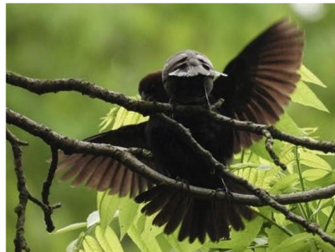
Male Brown-headed Cowbird performing feats of strength to impress the ladies

Mike Strzelecki got some nice photos on a difficult photography day.