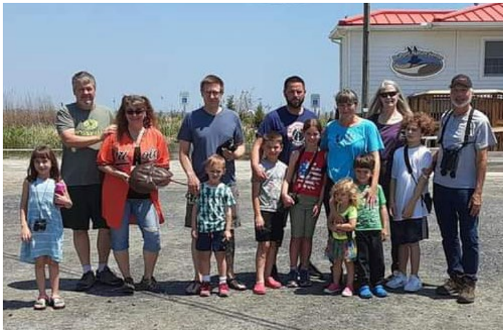
Family participants at the Youth Event