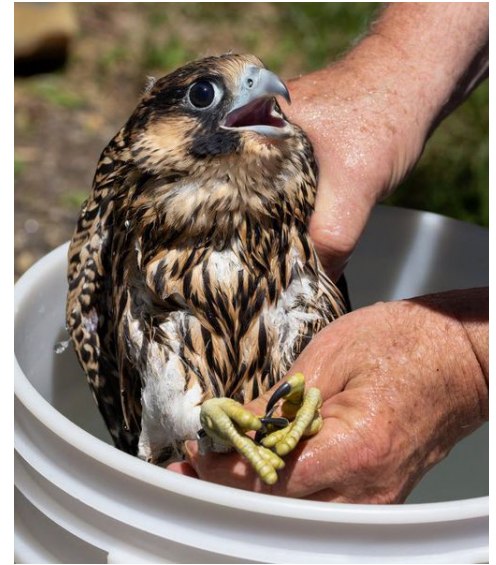
Craig dipping chick in warm water to make it heavy and discourage it from flying

On June 17, one of the chicks left the nest box and ended up on the ground, unhurt, but as it was still too young to fly, it needed to be returned to the box. Craig Koppie was called. Several of the chick's human