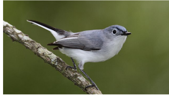
Blue-gray Gnatcatcher

Highlights: Osprey (feeding young), Tufted Titmouse (carrying food), Blue-gray Gnatcatcher (feeding young), Eastern Bluebird (nest building).