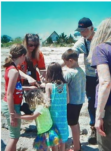
Horseshoe Crabs and Shorebirds